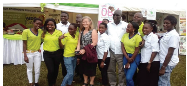
Baylor-Uganda CRS Community Staff on World AIDS Day 2019