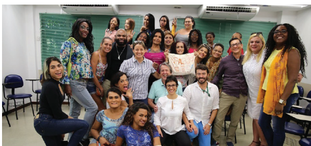
HPTN 091 Community Stakeholder Consultation in Brazil

The HPTN LOC has successfully engaged community members at all stages of science development, from concept generation, protocol development and study implementation to dissemination of study results, as an integral part of the team and as partners at participating sites. Communication with Network members, collaborators, study participants and stakeholders occurs through many platforms, including websites, emails, newsletters and social media channels (e.g., Facebook, Twitter, YouTube).