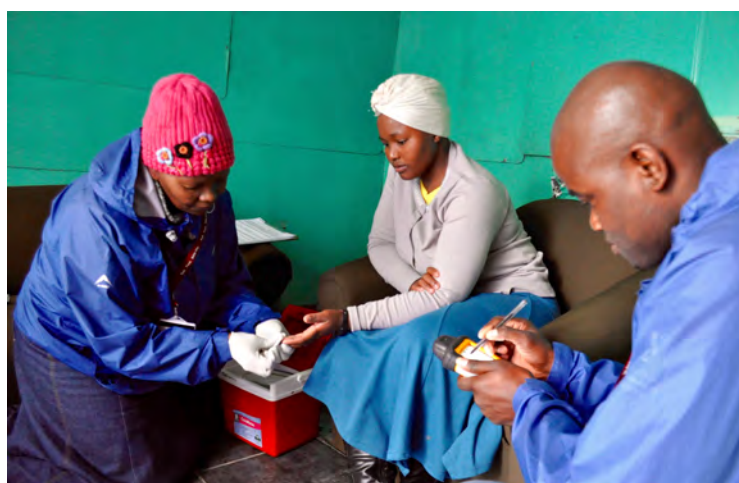
Field work in South Africa