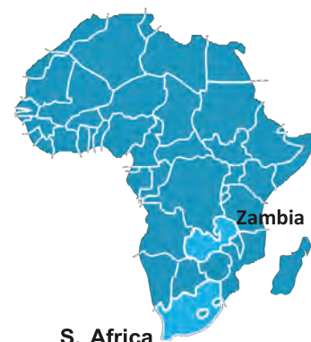
HPTN 071 (PopART) Study Countries

This study will investigate the impact on HIV incidence of the ‘PopART intervention’, a combination of several interventions, based upon universal voluntary HIV counseling and testing (with referral to care) provided to the