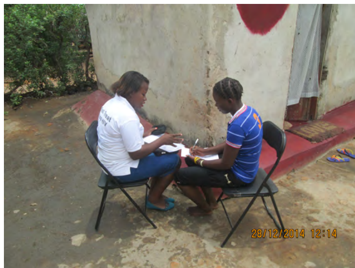
Field work in Zambia

The rationale for the HPTN 071 (PopART) study remains strong and its findings remain highly relevant to the scale-up of future HIV programming. Whereas the START study demonstrated individual benefit with early use of ART by HIV-infected patients, HPTN 052 showed efficacy of ART in prevention of HIV transmission among heterosexual discordant couples, and several observational studies indicate a decrease in the number of new infections with scale-up of treatment, HPTN 071 (PopART) will uniquely be able to provide an accurate estimate of the effect of a community-wide combination prevention package—one based on universal testing and treatment - on HIV incidence at the population level in severely affected countries in Southern Africa, as well as determining the feasibility and acceptability of delivering this intervention on a large scale.