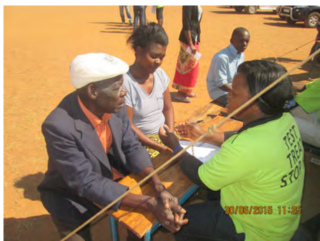
Field work in Zambia