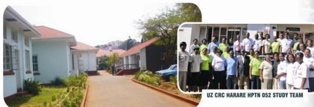
UZ CRC HARARE HPTN 052 STUDY TEAM