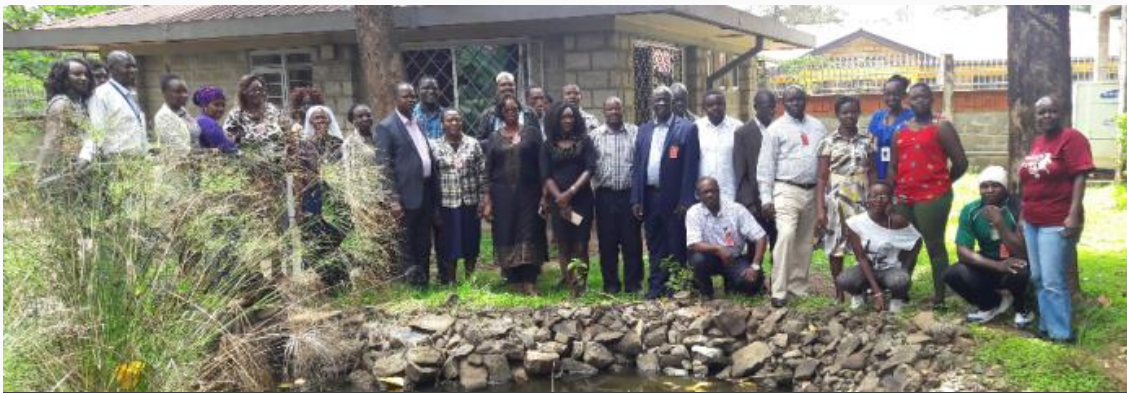
Community Advisory Board members at the Kisumu CRS offices

When a new study concept is introduced, a critical component of the process is engaging study communities. Helping community members understand the benefits and risks of study participation allows them to make decisions about how they want to support or contribute to a study's development. Whether a new drug, treatment method or technology, the messaging process is critical, and consultation at the protocol development stage is essential. The community engagement team at the KEMRI Centre for Global Health, aka Kisumu Clinical Research Site (CRS), in Kisumu, Kenya, regularly engage community stakeholders, including women, youth, female sex workers, and men who have sex with men.