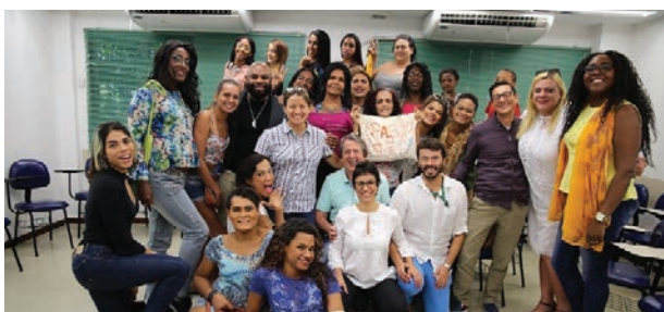
HPTN 091 Community Stakeholder Consultation in Brazil

The HPTN LOC has successfully engaged community members at all stages of science development, from concept generation, protocol development and study implementation to dissemination of study results, as an integral part of the team and as partners at participating sites. Communication with Network members, collaborators, study participants and stakeholders occurs through many platforms, including websites, emails, newsletters and social media channels (e.g., Facebook, Twitter, YouTube).