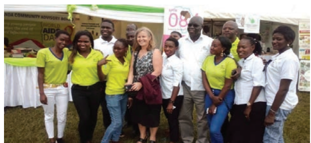
Baylor-Uganda CRS Community Staff on World AIDS Day 2019