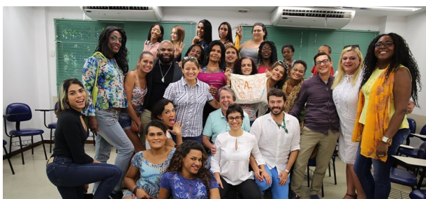
HPTN 091 Community Stakeholder Consultation in Brazil

The HPTN LOC has successfully engaged community members at all stages of science development, from concept generation, protocol development and study implementation to dissemination of study results, as an integral part of the team and as partners at participating sites. Communication with Network members, collaborators, study participants and stakeholders occurs through many platforms, including websites, emails, newsletters and social media channels (e.g., Facebook, Twitter, YouTube).