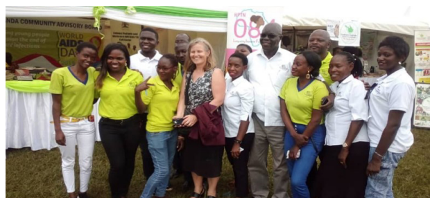
Baylor-Uganda CRS Community Staff on World AIDS Day 2019